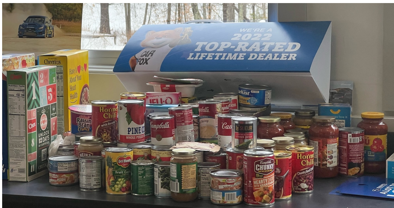
This photo is of the Food/Socks drive sponsored by Profile Subaru which took place in January.

Returning after a long COVID interruption, WMMA is scheduling the THIRTY-SECOND MOSTLY BACH FESTIVAL on August 26 at 7:30pm and August 27 at 4:30pm with full Baroque Orchestra, Festival Chorus, Vocal and Instrumental soloists. Information on all WMMA concerts will soon be posted on the White Mountain Musical Arts web page.