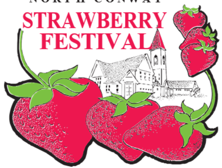
Vaughan CommunityServices and The First Church of Christ, Congregational in North Conway present a day of delicious strawberry delights and free family fun!

Summertime treats for the family. Strawberry Smoothies, Strawberry Shortcake, Strawberries Dipped in Chocolate, Hotdogs and Chips.