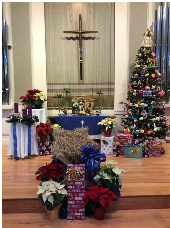
Sanctuary decorated awaiting the unwrapping of Love.