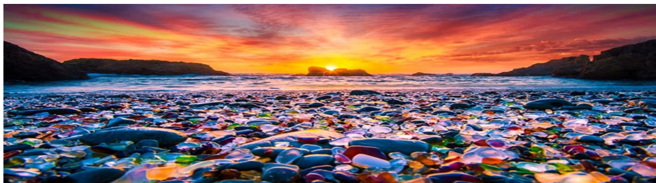
Glass Beach, Fort Bragg, CA

We look forward to seeing you at church for any and all our special Lenten services which will lead to yet another glorious Holy Week. Please join us and bring your friends!