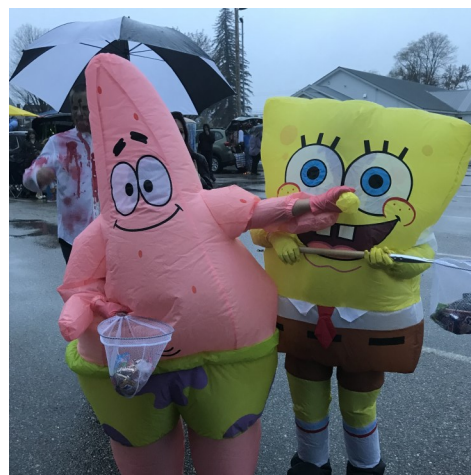
Patrick and SpongeBob